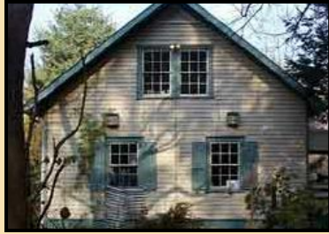
Wissahickon Environmental Center

Learning is FUN at Fairmount Park's two environmental centers: Wissahickon Environmental Center (WEC) and Pennypack Environmental Center (PEC) . Call our centers for an exciting program for your class, summer camp, pre-school or group.